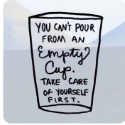
Time for YOU!